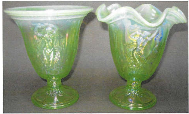
DANCING LADIES VASES Brent Mochel's Article Page 14