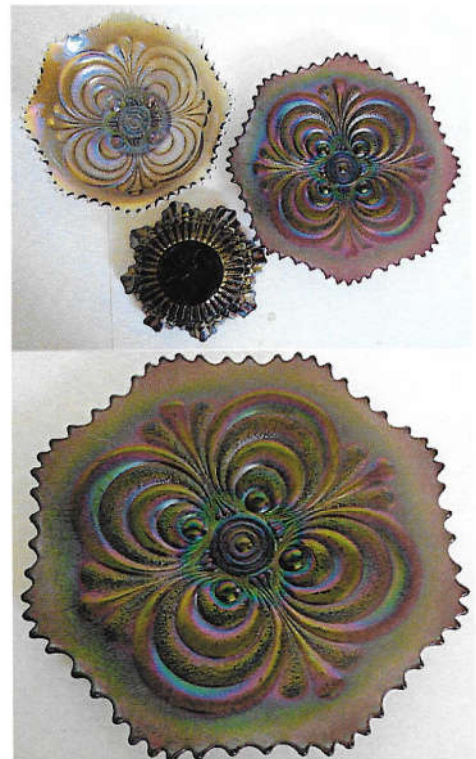
SCROLL EMBOSSED Barb Chamberlain's Article Page 8-9