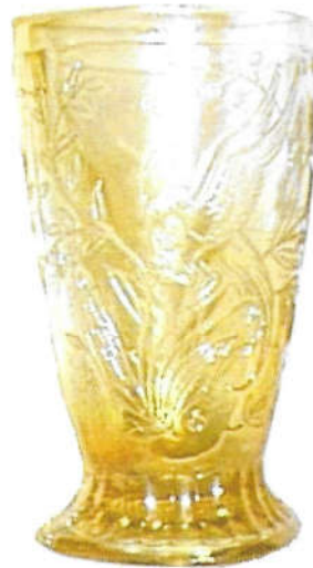
BIRD IN THE BUSH TUMBLER Bob Smith's Article Page 11