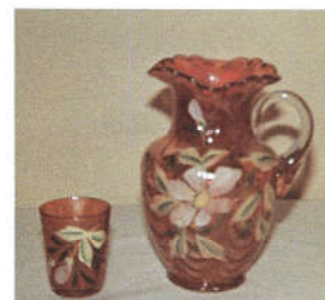
154. MAGNOLIA & DRAPE VARIANT