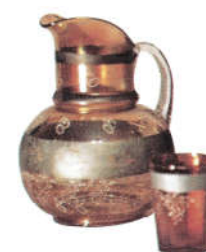
166. SILVER QUEEN