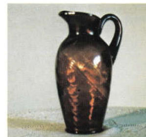
122. DIAGONAL BAND