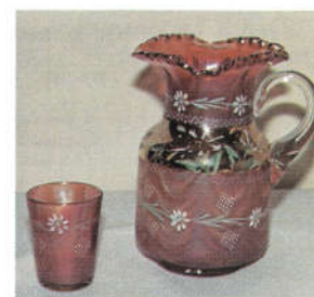
140. DOTTED DIAMONDS & DAISIES