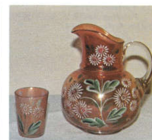
141. DOUBLE DAISY