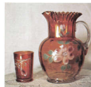
163. PRETTY PANELS

167. Pattern/ Painting: SILVER QUEEN Pitcher Style: Tankard Maker: Fenton Color: Marigold