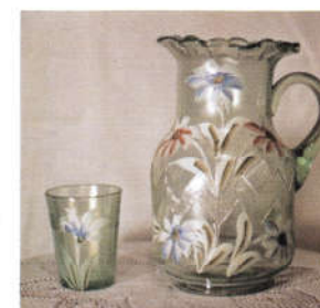
164. SHASTA DAISY