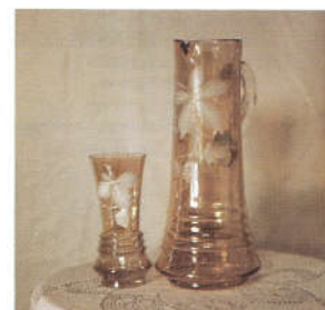
151. LATE STRAWBERRY

162. Pattern/ Painting: PHLOX Pitcher Style: Bulbous – Ruffled top Maker: Northwood Color: Marigold