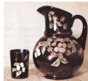
130. CHERRIES & LITTLE FLOWERS

132. Pattern/ Painting: CHRYSANTHEMUM Pitcher Style: Bulbous Maker: Unknown Color: Marigold