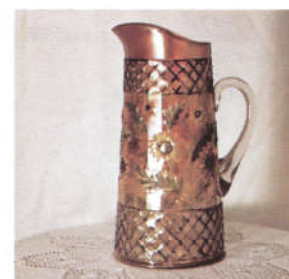
152. LATTICE & DAISY