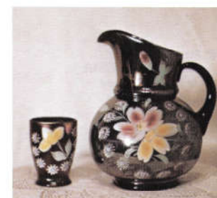
138. DAISY & LITTLE FLOWERS