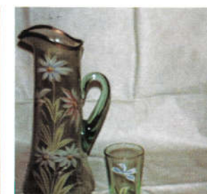
165. SHASTA DAISY