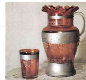
167. SILVER QUEEN