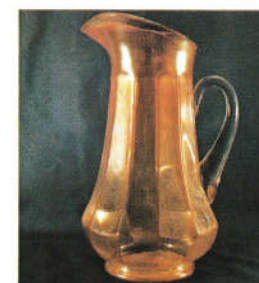
126. WIDE PANEL VARIET