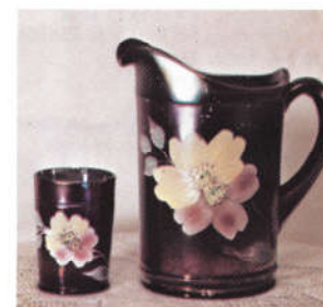
128. APPLE BLOSSOM