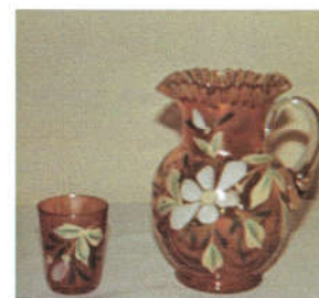
155. MAGNOLIA & DRAPE