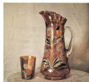
142. DOUBLE DAISY