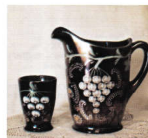
149. GROUND CHERRIES