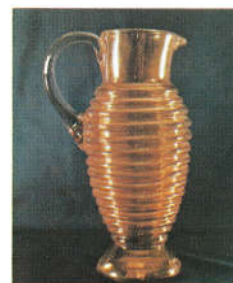
124. MELON RIB

Note: Pattern similar to the "Flute" pattern. Pitcher is a tankard style.