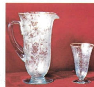
129. BROCADED ACORNS

130. Pattern/ Painting: CHERRIES & LITTLE FLOWERS Pitcher Style: Bulbous Maker: Northwood Color: Amethyst, Cobalt Blue, Marigold Note: Also referred to as Enamelled Cherries — Some tumblers have the "N" on the bottom.