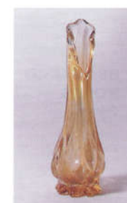
11. BEADED TEARDROPS

Maker: Fostoria Color: Marigold Type: Swung Note: Bud vase, 8 stubby feet, 6" tall - Originally named FRISKO.