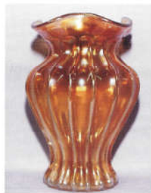
40. COLONIAL LADY

Maker: Imperial Color: Marigold Smoke Type: Molded