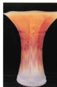
57. CUT SPRAYS

Maker: Imperial Color: Moonstone (R) Type: Molded Note: 10" high - 8 1/2" flare, 4 1/2" base, 3 cut sprays with ribbon.