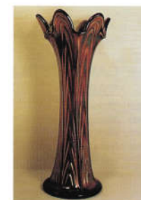
20. BOGGY BAYOU