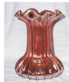
41. COLONIAL LADY, VARIANT