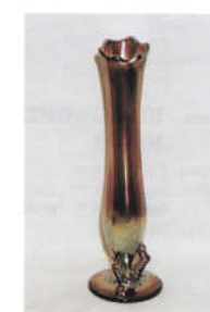
12. BEAUTY BUD

Maker: Dugan Color: Amethyst Marigold Type: Swung Note: With Twigs.