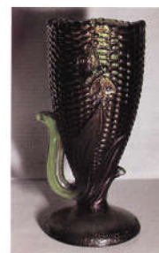
28. BUTTERFLY & CORN