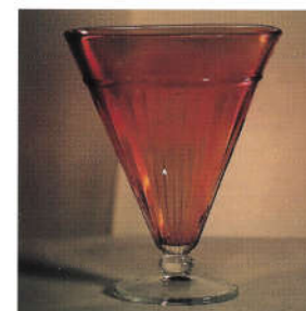
2. ADAM'S RIB