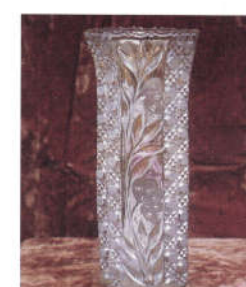
33. CANE & DAISY CUT