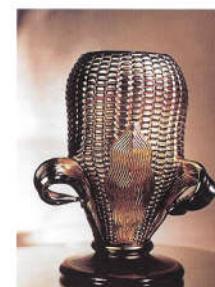
49(B). CORN PULLED HUSK