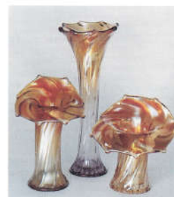
54. CURLED RIB

Maker: Jenkins Color: Marigold Smoke Type: Molded Note: 10" cylinder vase.