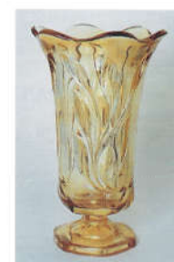
24. BROKEN BRANCH