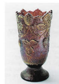
17. BLACKBERRY BARK