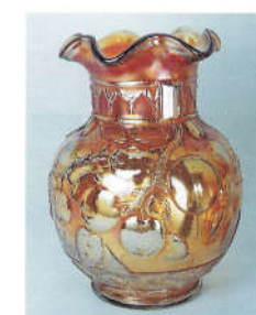
5. APPLE TREE

Maker: Fenton Color: Marigold (VR) Type: Blown Note: Made from pitcher blank, 2 known, 1 ruffled & 1 round with flared top. See front cover for vase with rounded top. This vase comes in a noncarnival Topaz opal color.