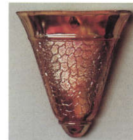
53. CRACKLE WALL VASE

Maker: Imperial Color: Marigold Smoke Lavender Type: Swung Note: Both the JIP and swung vases come in various heights.