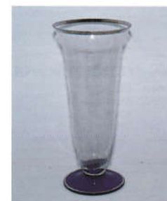
23. BROCADED ROSES