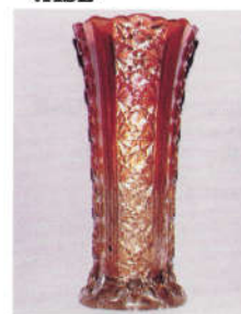
34. CANE PANELS