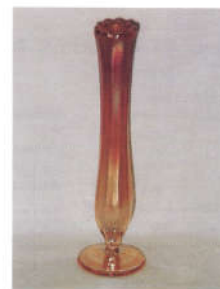
13. BEAUTY BUD

Maker: Dugan Color: Marigold Smoke Type: Molded Note: Sometimes referred to as COCKATOO.