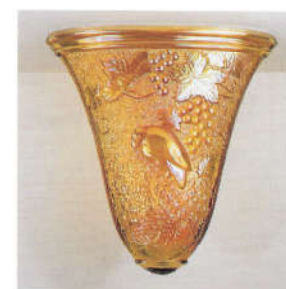
15. BIRD & GRAPES

Maker: Unknown Color: Marigold Type: Blown Note: Maker is possibly Fostoria.