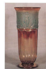
36. CLASSIC ARTS