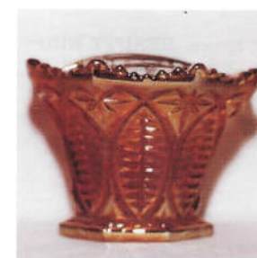
3. AFRICAN SHIELD

Maker: Fostoria Color: Marigold (VR) Type: Molded Note: Only 1 vase reported