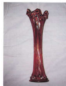
25. BULLSEYE & BEADS

Maker: Czechoslovakian Color: Marigold Type: Molded Note: 2 1/2" base