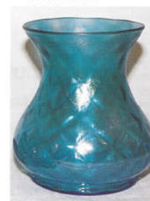
44. CONCAVE DIAMOND