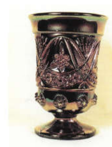
55. CURVED STAR