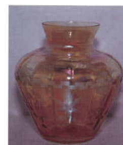
29. BUTTERFLY, ETCHED