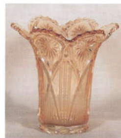
51. COUNTRY KITCHEN

Maker: Dugan Color: Marigold Type: Molded