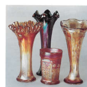
27. BUTTERFLY & BERRY