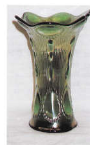
10. BEADED BULLSEYE

Maker: Imperial Color: Amber Amethyst Green Marigold Purple Vaseline Type: Swung Note: 3 3/8" base.