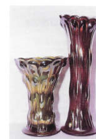
26. BULLSEYE & LOOP