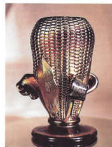
49(A). CORN PULLED HUSK

Maker: Imperial Color: Marigold Type: Molded