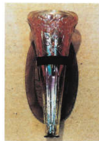
19. BLOSSOMS & BAND

Maker: Fostoria Color: Ice Blue Ice Green Pink Type: Blown