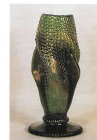
48. CORN HUSK