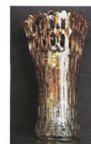
18. BLACKBERRY, OPEN EDGE

Maker: Dugan Color: Marigold Type: Molded Note: Car vase, some collectors believe this was made by Imperial.