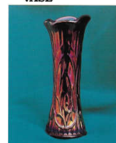
35. CIRCLE SCROLL