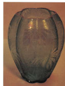
22. BROCADED PALM

Maker: Fostoria Color: Marigold (R) Type: Molded