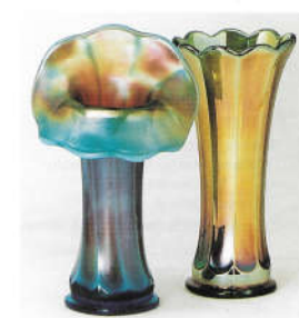
45. CONCAVE FLUTE

Maker: Westmoreland Color: Amber Amethyst Blue Opalescent (S) Green Marigold Moonstone (S) Olive Green Teal Type: Swung Note: JIP & straight vase, 3" base.