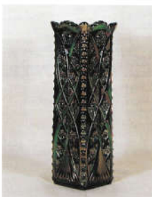
43. COLUMN FLOWER

Maker: Westmoreland Color: Amber Amethyst Blue Opalescent (R) Lime Green Marigold Teal Moonstone (S) Type: Swung Note: These are found as JIP also.