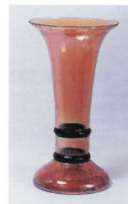
16. BLACK BANDED

Maker: Fenton Color: Blue (R) Marigold (VR) Type: Swung Note: Round & square tops - made from Blackberry 2 row open-edge basket.