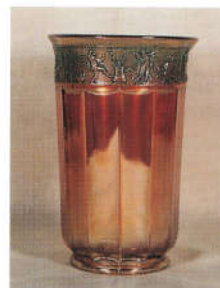
37. CLASSIC ARTS

Maker: Imperial Color: Amethyst Marigold Type: Molded Note: This has sometimes been call "Colonial Variant".