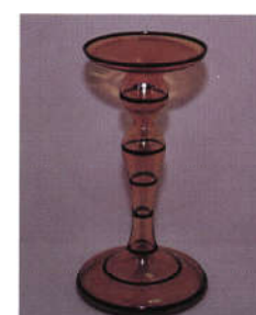
32. CANDLEHOLDER VASE