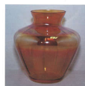
9. BALLOONS - BLANK

Maker: Imperial Color: Marigold Type: Blown Note: This is the blank for the "Balloons" & "Butterfly Etched" vases.