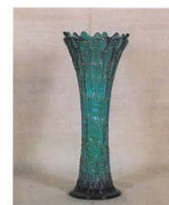
14. BIG BASKET WEAVE