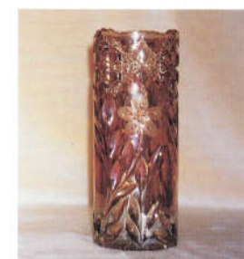
56. CUT FLOWERS

Maker: Imperial Color: Moonstone (R) Type: Molded Note: 10" high - 8 1/2" flare, 4 1/2" base, 3 cut sprays with ribbon.