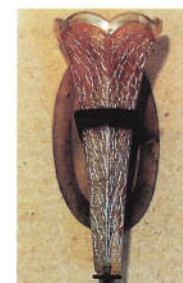
52. CRACKLE CAR VASE