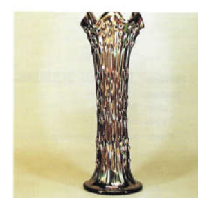
6. APRIL SHOWERS

Maker: Fenton Color: Amethyst Blue Aqua-Opal (R) Green Marigold Red (R) Moonstone (R) Teal (S) Vaseline (S) White (S) Type: Swung Note: Most have Peacock Tail pattern in bottom of base.