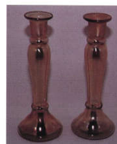
31. CANDLEHOLDER VASE