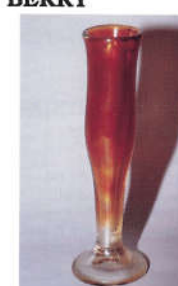
30. CANDLE VASE