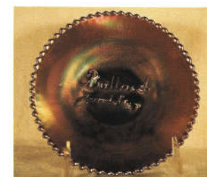
71. "BALLARD-MERCED, CA"/BASKETWEAVE