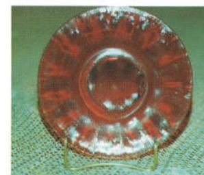
68. PLAIN/WIDE PANEL