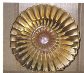
56. PLAIN/PILLAR FLUTE