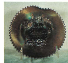
79. "E.A. HUDSON FURNITURE CO."/BASKETWEAVE