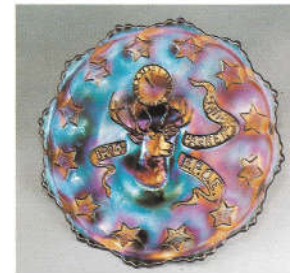
94. PARKERSBURG ELK 1914/WIDE PANEL