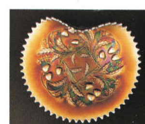
69. WILD STRAWBERRY/BASKETWEAVE