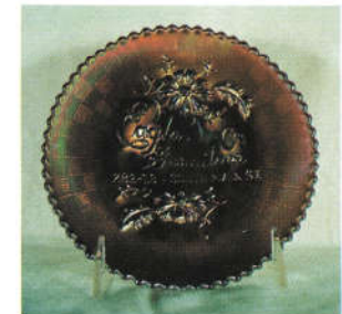
80. "EAGLE FURNITURE CO."/BASKETWEAVE