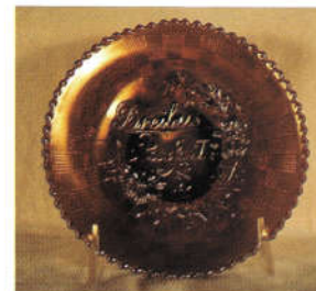
78. "DREIBUS PARFAIT SWEETS"/BASKETWEAVE