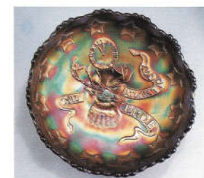
95. ATLANTIC CITY ELK 1911/ WIDE PANEL

96. Pattern: INDIANA STATE HOUSE/BERRY & LEAF CIRCLE