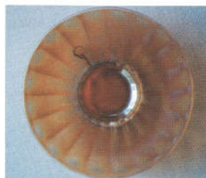
55. PLAIN/LUSTRE & CLEAR