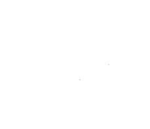
70B. WISHBONE & SPADES/BASKETWEAVE