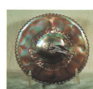
89. "SEASONS GREETINGS EAT PARADISE SODAS" / WIDE PANEL