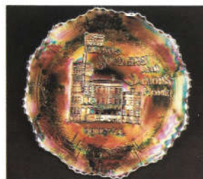
93. "ILLINOIS SOLDIERS & SAILORS HOME"/BERRY & LEAF CIRCLE

Maker: Fenton Color: 7 1/2 inch Blue (Rare)