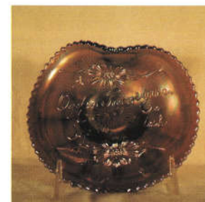
88. "OGDEN FURNITURE & CARPET CO." / WIDE PANEL