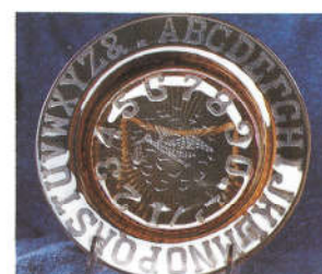
60. ABC STORK/PLAIN