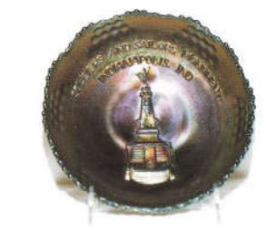
98. INDIANAPOLIS SOLDIERS & SAILORS MONUMENT/ BERRY & LEAF CIRCLE