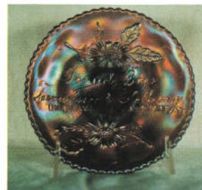
84. "GEVURTS BROS. FURNI- TURE & CLOTHING" / WIDE PANEL

Maker: Northwood Color: 6 inch Amethyst (Rare)