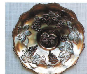
65. VINTAGE/WIDE PANEL