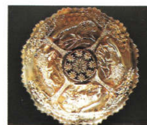
54. LIONS/BERRY & LEAF CIRCLE