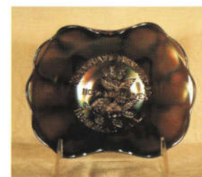
85. "GREENGARD FURNITURE CO." / WIDE PANEL