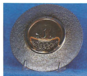
59. PLAIN/SAILING SHIP