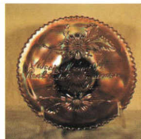
87. "NORRIS N. SMITH REAL ESTATE & INSURANCE" / WIDE PANEL

Maker: Fenton Color: 6 inch Amethyst (Rare)