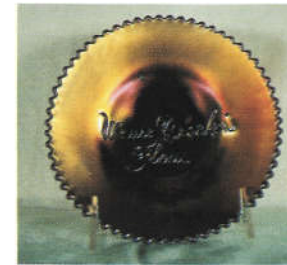
73. "WE USE BROEKERS FLOUR"/BASKETWEAVE