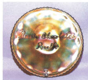
90. "ROODS CHOCOLATES"/ WIDE PANEL

Maker: Fenton Color: 6 inch Amethyst (Rare) Note: Plate shown is Handgrip.