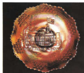
96. INDIANA STATE HOUSE/ BERRY & LEAF CIRCLE

Maker: Fenton Color: 8 inch Blue (Rare) Note: Only a very few known.