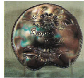
72. "BRAZIER'S CANDIES"/WIDE PANEL