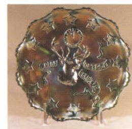
97. DETROIT ELK 1910/ WIDE PANEL