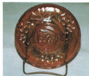
67. PLAIN/WATERLILY & CATTAILS