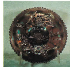
75. "COMPLIMENTS OF THE CENTRAL SHOE STORE"/WIDE PANEL