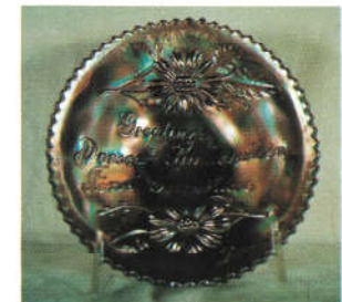
77. "GREETINGS DORSEY AND FUNKENSTEIN FINE FURNITURE"/

78. Pattern: "DREIBUS PARFAIT SWEETS"/BASKETWEAVE