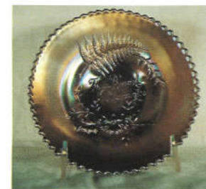
82. "FERN BRAND CHOCOLATES" / BASKETWEAVE