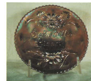
83. "GEORGE W. GETTS PIANOS" / WIDE PANEL

84. Pattern: "GEVURTS BROS. FURNITURE & CLOTHING" / WIDE PANEL