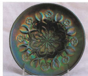
70A. WISHBONE & SPADES/PLAIN