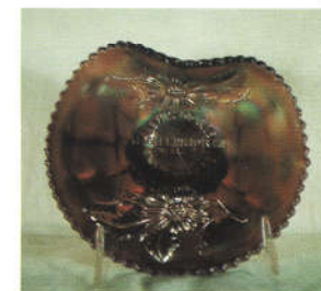
92. "UTAH LIQUOR CO."/ WIDE PANEL

93. Pattern: "ILLINOIS SOLDIERS & SAILORS HOME"/ BERRY & LEAF CIRCLE