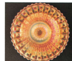
66. PLAIN/WAFFLE BLOCK