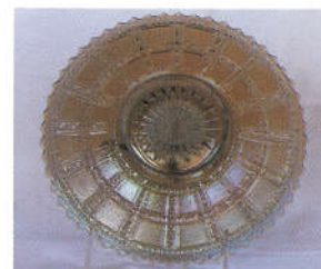
50. PLAIN/FROSTED BLOCK