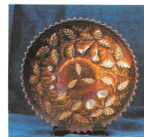
51. FRUITS & FLOWERS/ BASKETWEAVE