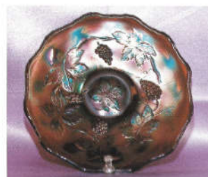
64. VINTAGE/WIDE PANEL