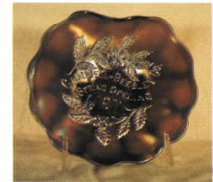
74. "CAMPBELL & BEESLEY SPRING OPENING 1911"/WIDE PANEL

75. Pattern: "COMPLIMENTS OF THE CENTRAL SHOE STORE"/WIDE PANEL