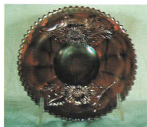
52. GARDEN MUMS/WIDE PANEL