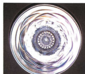
53. LATTICE & POINTS/ PLAIN