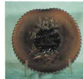
76. "DAVIDSON'S SOCIETY CHOCOLATES"/BASKETWEAVE