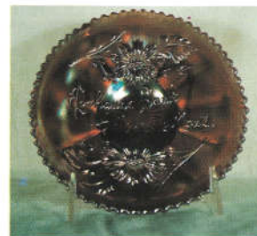
81. "EXCHANGE BANK GLEN DIVE, MONT." / WIDE PANEL

Maker: Fenton Color: 6 inch Amethyst (Rare)