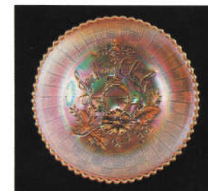
86. "JOCKEY CLUB" / BASKETWEAVE

87. Pattern: "NORRIS N. SMITH REAL ESTATE & INSURANCE" / WIDE PANEL