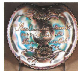
91. "STERLING FURNITURE CO."/WIDE PANEL