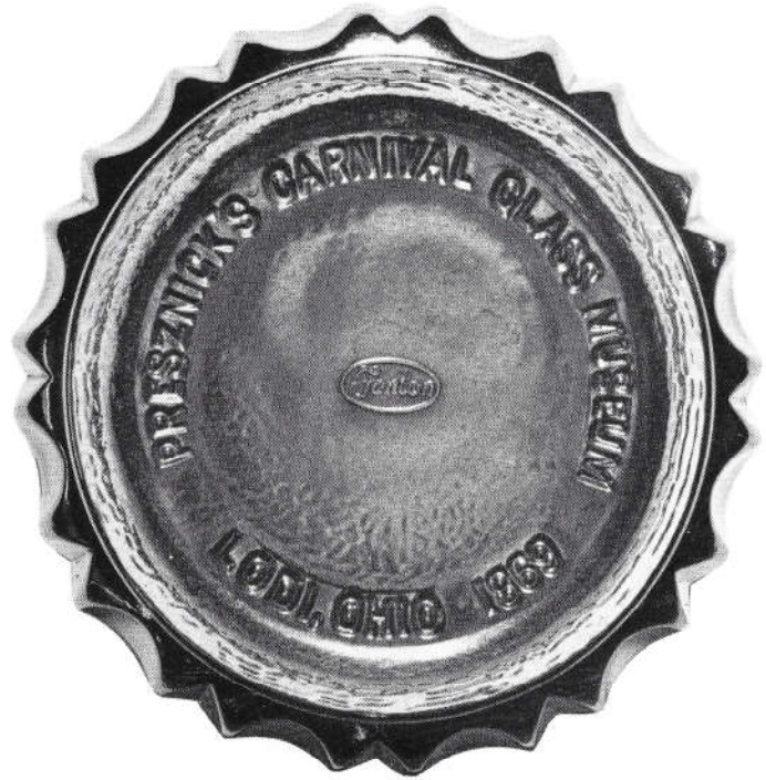
Base of Humidor

We are happy to send you our Carnival Glass Souvenir Issue with our compliments.