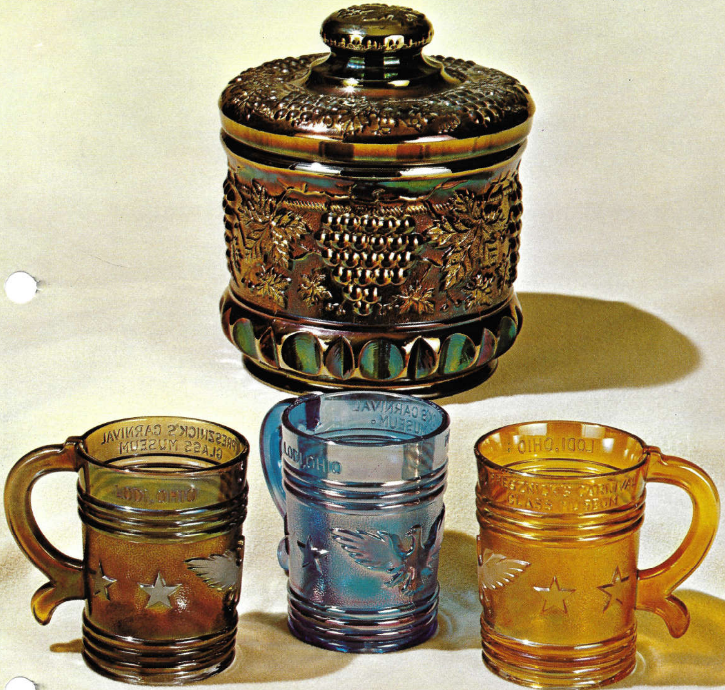
FENTON GRAPE and CABLE HUMIDOR IMPERIAL EAGLE and STAR MUGS