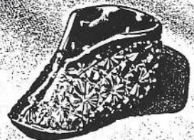
1994 CN Bootie

OLDE VIRGINIA GLASS Williamstown, W. Va. 26187