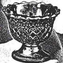
9151 CN Fld. Nut Dish