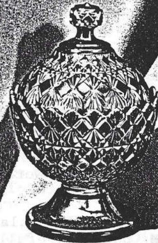
9180 CN Candy Box