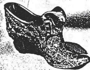
1995 CN Slipper