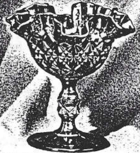
9120 CN Compote