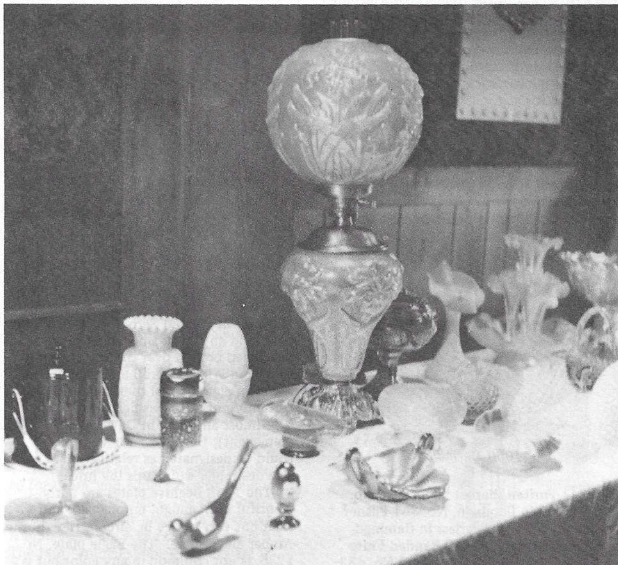
Some of the Fenton glass offered during the auction.