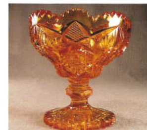
75. PLAIN / FIVE-THIRTY-SEVEN

Maker: Millersburg Color: Green (R) Note: Only 1 known.