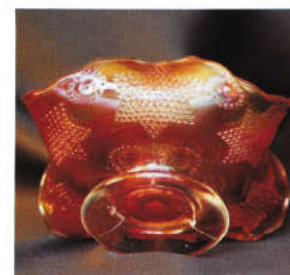
59. PLAIN / BEADED STAR