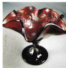
113. WREATH OF ROSES / PLAIN

Maker: Fenton Color: Marigold Amethyst Blue Green White