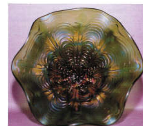
100. ROSALIND VT/PLAIN

Maker: Fenton Color: Marigold Ice Blue (R) Ice Green (R) White (S)