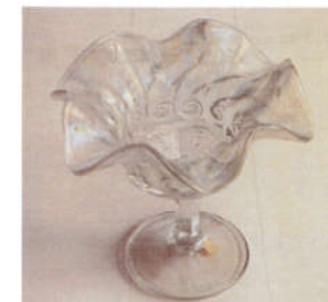
69. CONSTELLATION / SEAFOAM