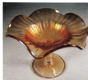
64. BOUTONNIERE / PLAIN

Maker: Westmoreland Color: Marigold Green Blue Opal (S) Amethyst Peach Opal