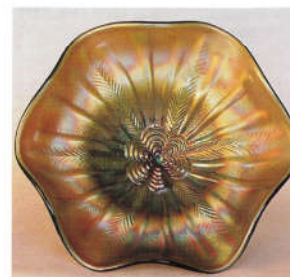
93. PEACOCK TAIL VT/PLAIN