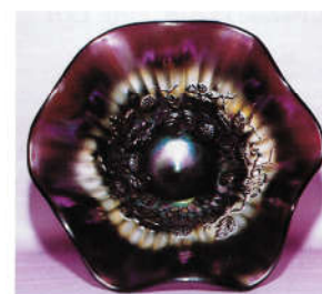
62. BLACKBERRY & RAYS / PLAIN