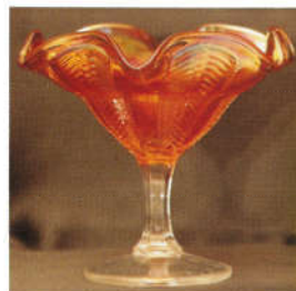
79. PLAIN / HERRINGBONE & BEADED OVAL

Maker: Fenton Color: Marigold Amethyst (S) Blue Green (S) White (R) Vaseline (R) Red (R) Lime Green Opal (R) Ice Blue / Marigold Note: Shapes known are ruffled, goblet and 3-in-1 edge.