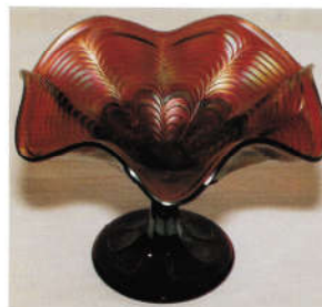
92. PEACOCK TAIL/PLAIN

Maker: Fenton Color: Marigold Green Ice Blue (S) Ice Green (R) White Aqua/Marigold Lavender (S) Red (R)