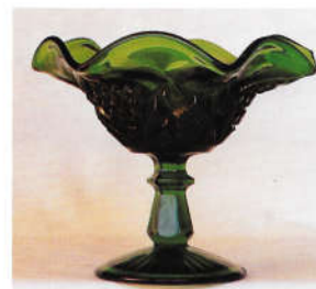
74. PLAIN / FINE CUT FLOWER VT