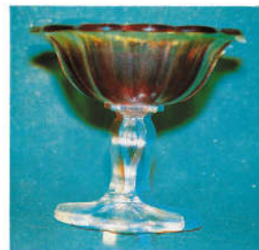
77. PLAIN / WIDE PANEL