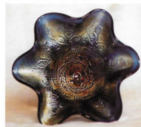
96. PERSIAN MEDALLION/ PLAIN