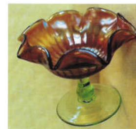
105. SMALL RIB / PLAIN