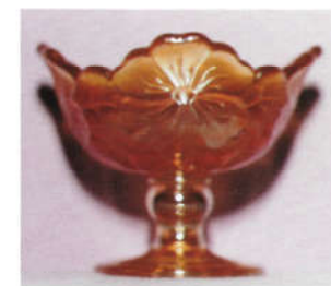
112. PLAIN / WILD ROSE WREATH

Maker: Fenton Color: Marigold Amethyst Blue Green White