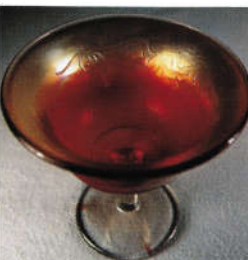
101. ROSE SPRAY/PLAIN

Note: This is the miniature size compote.