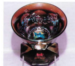
90. OLYMPIC/WIDE PANEL