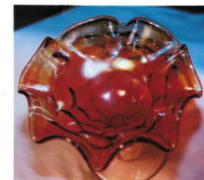
84. PLAIN/HONEYCOMB & CLOVER

Maker: Millersburg Color: Marigold Amethyst Green Note: Shapes known are octagon and round.