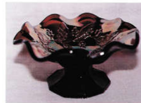
82. HOLLY SPRIG/ WIDE PANEL

Maker: Fenton Color: Marigold Amethyst Blue Green White Amber