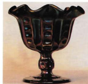
67. PLAIN / COIN SPOT

Maker: Dugan Color: Marigold Amethyst (S) White Peach Opal (S)