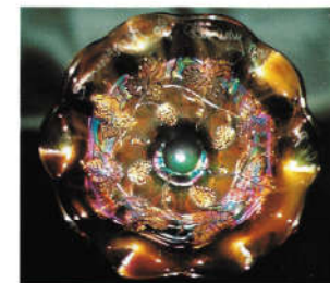
109. STRAWBERRY WREATH / PANELED

Maker: Westmoreland Color: Marigold Amethyst Teal Peach Opal Blue Opal Note: Pattern is Two-Seventy