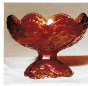
71. PLAIN / COSMOS & CANE