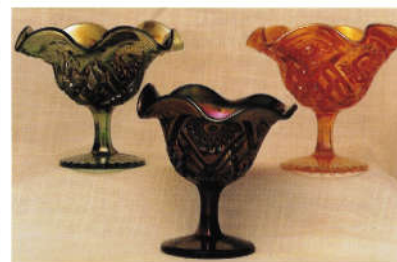
80. PLAIN / HOBSTAR FLOWER