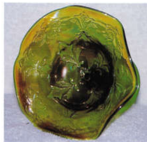
76. FLEUR-DE-LIS / PLAIN

Maker: Imperial Color: Marigold (R) Amethyst Green Amber (S) Smoke (S)