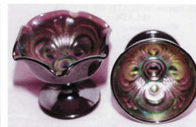
103. SCROLL EMBOSSED /PLAIN