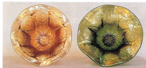
85. LEAF & LITTLE FLOWER/ PLAIN

Maker: Westmoreland Color: Marigold Amethyst Teal Amber