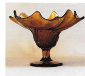
86. LEAF SWIRL/PLAIN

Maker: Westmoreland Color: Marigold Aqua Blue Opal Teal Peach Opal Note: Pattern name is "Little Beads".