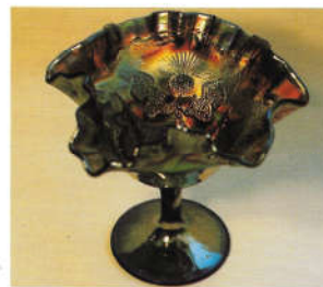
104. SCOTCH THISTLE / PLAIN

Maker: Westmoreland Color: Marigold Amethyst Green Marigold/Milkglass