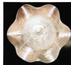
65. CAPTIVE ROSE / PLAIN