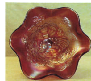
94. PEACOCK & URN/PLAIN

Maker: Northwood Color: Marigold Green Ice Blue (R) Amethyst White (S)