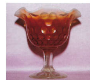
66. COIN DOT / PLAIN

Maker: Dugan Color: Marigold Blue (R) White Amethyst Green (S) Peach Opal