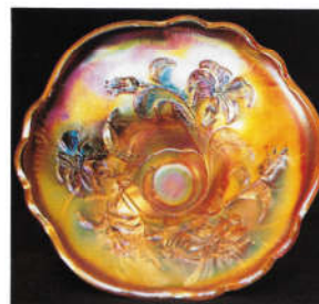
58. AMARYLLIS / PLAIN

Maker: Fenton Color: Marigold Amethyst Blue Green White (S) Vaseline (S)