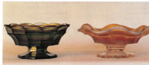
87. PLAIN/LITTLE BEADS & WIDE PANEL

Maker: Millersburg Color: Amethyst (R) Green (R)