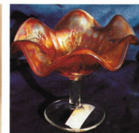
81. HOLLY / PLAIN