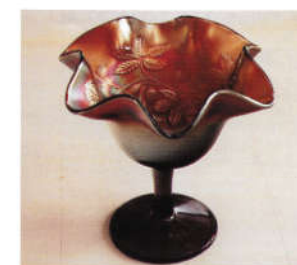
63. BLACKBERRY SPRAY / PLAIN

Maker: Millersburg Color: Marigold (S) Amethyst (S) Green (S)