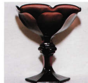
68. PLAIN / PANELED (COLONIAL)