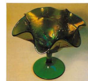
60. BIRDS & CHERRIES / PLAIN

Maker: Fenton Color: Marigold Amethyst (S) Green (S) Blue White (R)