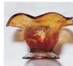
83. PLAIN/HOLLY & POINSETTIA