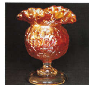
72. PLAIN / DAISY SQUARES

Maker: Northwood Color: Marigold (S) Amethyst (S) Green (S) White (R)