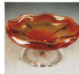
111. PLAIN / WIDE PANEL