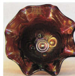
102. SCROLL EMBOSSED /PLAIN