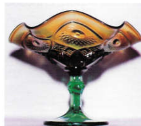
89. NORTHWOOD NEAR CUT/ PLAIN

Maker: Fenton Color: Marigold Amethyst (S) Blue Green (S) White Peach Opal (R) Vaseline (R) Ice Blue/Marigold Note: Known shapes are ruffled & goblet shaped.