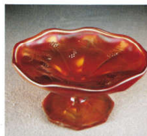
61. BLACKBERRY / WIDE PANEL

Maker: Fenton Color: Marigold Amethyst Green Blue Aqua (R) Red (R)