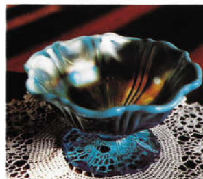
110. PLAIN / RIBBED (TWO SEVENTY)

Maker: U.S. Glass Color: Marigold (R) Note: Also referred to as miniature intaglio.