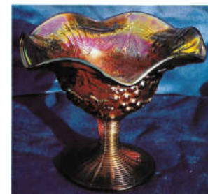
78. GRAPE / GRAPE