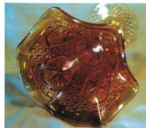
107. PLAIN / STAR MEDALLION

Maker: Millersburg Color: Marigold Amethyst Green Vaseline Note: Some pieces may be hand painted for souvenirs of a city.