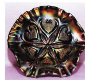
108. STAR FISH / PLAIN