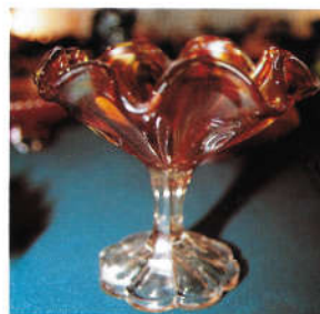
70. PLAIN / COLUMBIA

Maker: Unknown Color: Marigold (S) Amethyst (S) Green (S) Amber (R) Note: Ruffled & Crimped Edges.