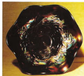
73. FERN / DAISY & PLUME