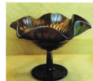
106. SMOOTH RAYS / PLAIN

Maker: Imperial Color: Marigold Green Smoke