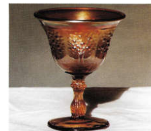
91. PLAIN/ORANGE TREE