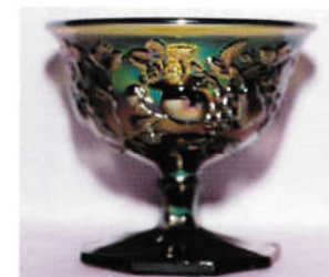
88. PLAIN/MULTI FRUITS & FLOWERS