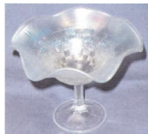
4. BLACKBERRY / BASKETWEAVE