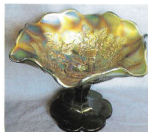
38. PEACOCK & URN / WIDE PANEL