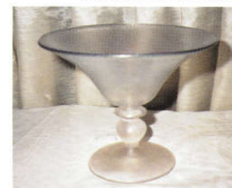
42. PLAIN / PLAIN