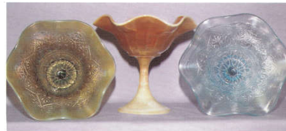
28. HEARTS & FLOWERS