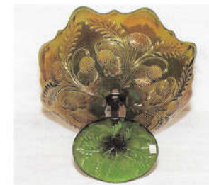
31. PLAIN / INVERTED THISTLE