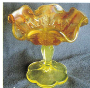
1. ACORN / WIDE PANEL

Note: This compote was made in a square and round shape. The square shape is rare.