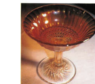
21. PLAIN / FLUTE & CANE