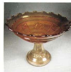
48. PLAIN/ROSE PANELS