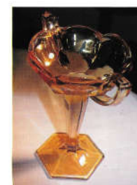
11. PLAIN / WIDE PANEL