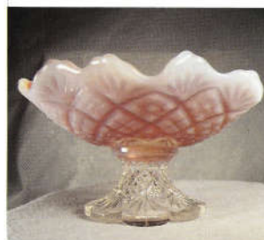
19. PLAIN / FILE & FAN