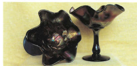
33. IRIS / PLAIN