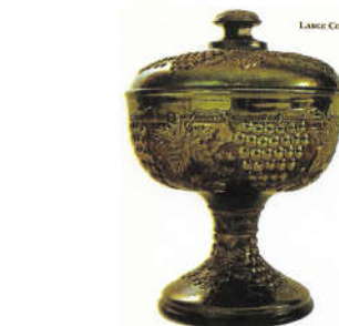
24. PLAIN / GRAPE & CABLE