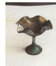
39. PERSIAN MEDALLION / PERSIAN MEDALLION