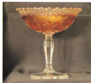
16. PLAIN / DIAMOND & DAISY CUT