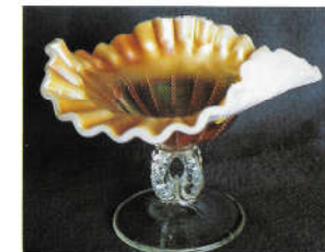
3. PLAIN / BEADED PANELS