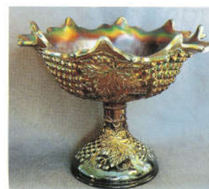
23. PLAIN / GRAPE & CABLE