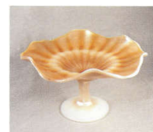
46. RAYS / PLAIN