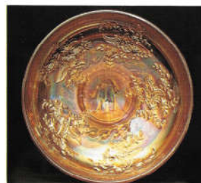
7. BUTTERFLY & BELLS / PLAIN & S SCROLL