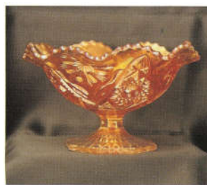
22. PLAIN / FOUR SEVENTY FOUR