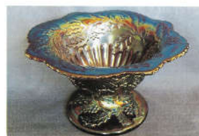
10. CHRISTMAS HOLLY / HOLLY