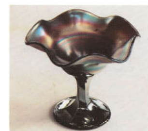
43. PLAIN / PLAIN