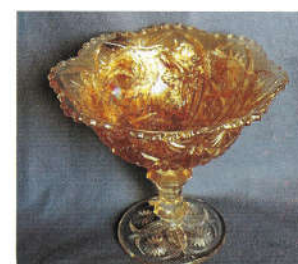
45. POPPY / POTPOURRI