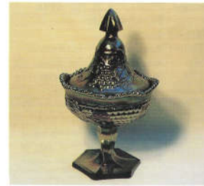
25. PLAIN / GRAPE & CABLE SWEETMEAT

Note: This Compote is known as "Mikado".