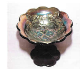
57. WILD FLOWER/WIDE PANEL