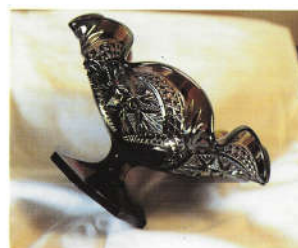
50. SCROLL EMBOSSED/HOBSTAR & FILE