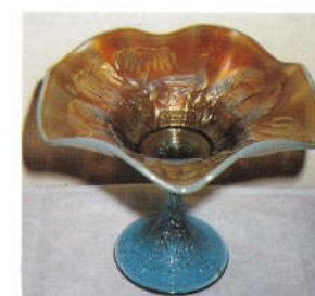
37. PEACOCK AT THE FOUNTAIN