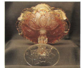
29. PLAIN / HOBSTAR BAND