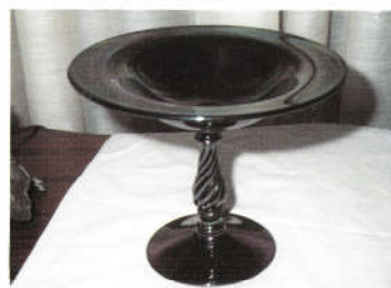
53. PLAIN/TAFFETA LUSTRE

Maker: Fenton Color: Amethyst Blue Green Marigold