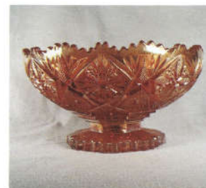
17. WIDE PANEL / FANCY FLOWERS