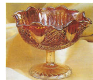
40. PLAIN / PINEAPPLE