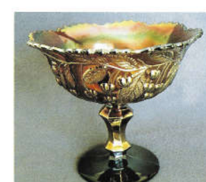
9. PLAIN / CHERRIES