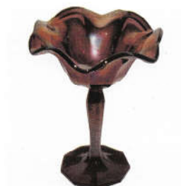
55. TULIP WIDE PANEL/PLAIN

Maker: Millersburg Color: Amethyst (R) Green (R) Marigold (R) Vaseline (R)