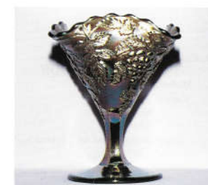
12. PLAIN / DEEP GRAPE