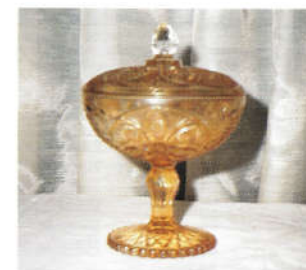
18. PLAIN / FERRIS WHEEL