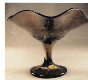
2. PLAIN / BASKETWEAVE