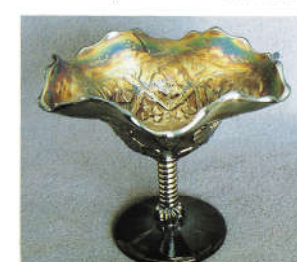
6. BLOSSOMTIME / WILDFLOWER