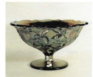
32. PLAIN / INVERTED STRAWBERRY