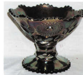
30. PLAIN / HOBSTAR & FEATHER