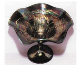
27. HARVEST POPPY / PLAIN PANEL