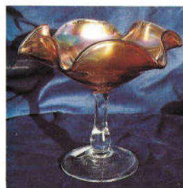
41. PLAIN / PLAIN