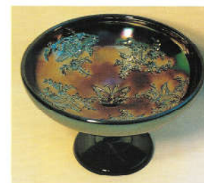
8. PLAIN / BUTTERFLY BUSH