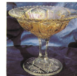
51. PLAIN/STAR & FILE