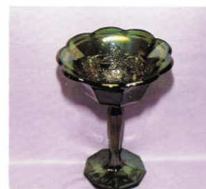
20. WIDE PANEL / FLOWERING VINE