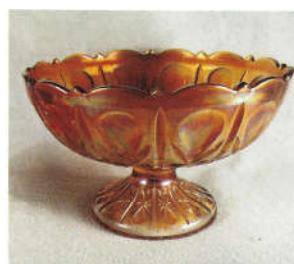
44. PLAIN / PROPELLAR