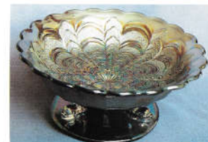
14. DOLPHINS ROSILAND / WIDE PANEL