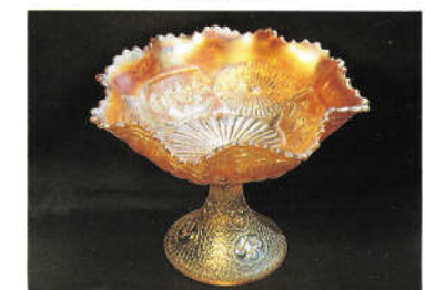
34. MEDALLION & CHRYSANTHUMS / CHERRIES