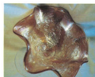
52. STREAM OF HEARTS/PERSIAN MEDALLION