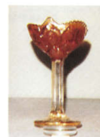
36. PLAIN/OHIO STAR