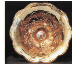
26. GRAPE WREATH / WIDE PANEL