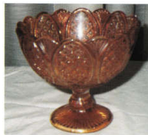
13. PLAIN / DIAMOND & OVALS

Maker: Northwood Color: Amethyst Green Marigold