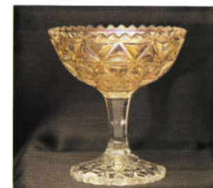
15. PLAIN / DIAMOND BLOCK