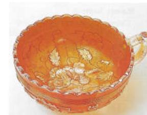
33. Lightning Flower