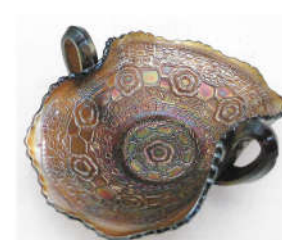
9. Captive Rose