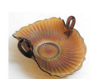
54. Smooth Rays