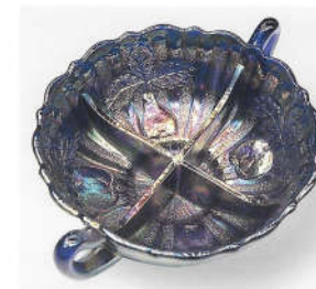
62. Two Fruits