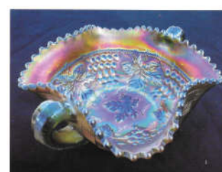
21. Grape and Cable

Maker: Northwood Color: Amethyst/purple, aqua (VR), aqua opal (VR), blue, green, ice blue opal (R), marigold, white (R) Type: Collar base Note: All of the stippled pieces are from scarce to very rare.