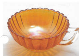
46. Pillar Flute