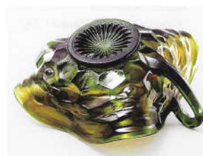
28. Honeycomb and Clover