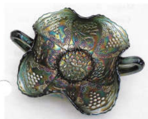
34. Lotus and Grape