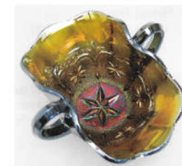
39. Night Stars