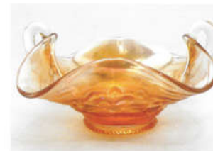
64. Waterlily and Cattails

Note: This pattern could be confused with Fenton's Rose Bouquet or Northwood's Basket of Roses.