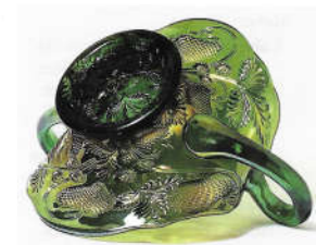
31. Inverted Strawberry