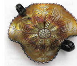
35. Lotus Land