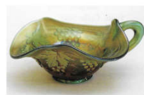
23. Grape and Cable