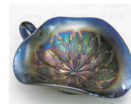
32. Leaf Rays