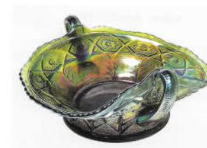
30. Inverted Feather