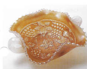
22. Grape and Cable, Stippled

Maker: Imperial Color: Green (helios) (S), marigold, olive (VR), purple (S) Type: Collar base Note: Imperial made several items in this pattern but the nappy is not plentiful.