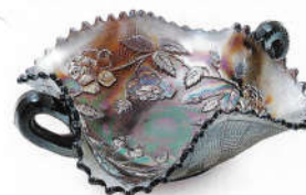
1. Basket of Roses