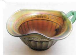
37. Lustre Flute