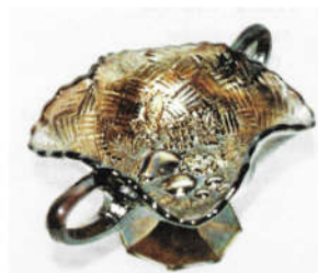
17. Fruit Basket