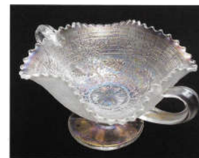
14. Embroidered Mums