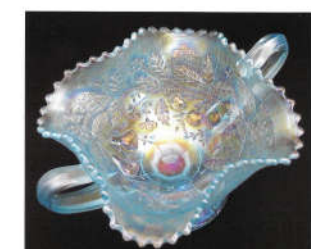
18. Fruits and Flowers

Maker: Northwood Color: Blue, green, marigold, Renninger blue (R) Type: Stemmed Note: These have the basketweave backside pattern.