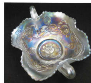
52. Rose Bouquet