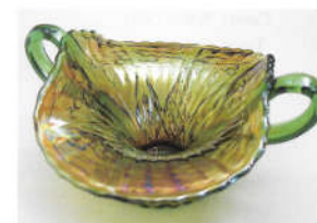
42. Paneled Holly