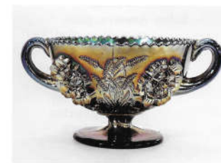
15. Floral and Wheat

Maker: Imperial Color: Amethyst Type: Collar base Note: This is the same as the small berry bowl.