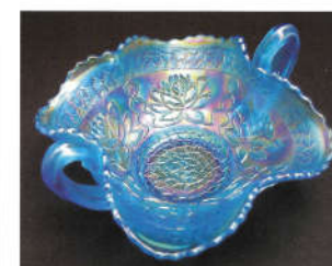
47. Pond Lily