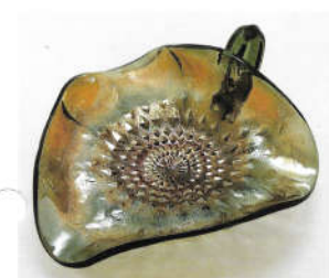
58. Stippled Diamonds