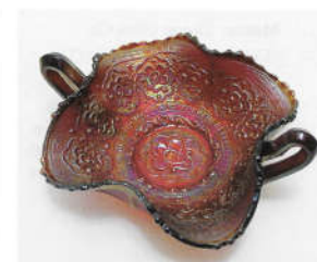
45. Persian Medallion