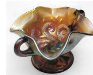
51. Question Mark