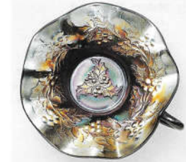
27. Holly and Berry