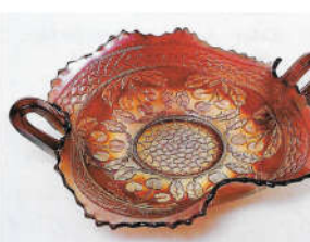
11. Cherry Circles