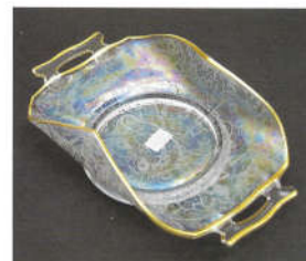
4. Brocaded Daffodils