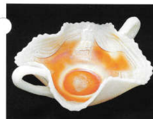
49. Prayer Rug

Maker: Fenton Color: Amber (S), amberina (S), blue, green, lime green opal (S), marigold, red (R), vaseline (S), vaseline opal (R) Type: Collar base Note: These can be found with a plain center and in some colors with a strawberry in the center. Also found as a card tray shape.