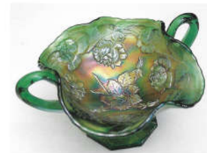
66. Wreath of Roses