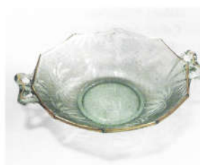
5. Brocaded Palms