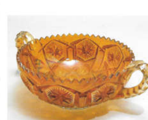
56. Star and File