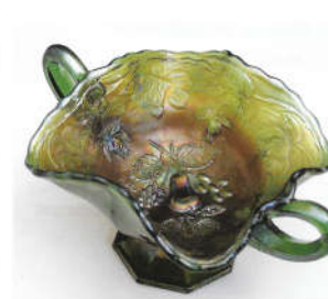
53. Roses and Fruit