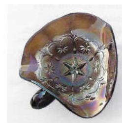
40. Night Stars