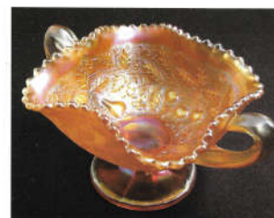
19. Fruits and Flowers, stippled

Maker: Northwood Color: Amethyst, blue, custard, green, marigold, peach opal (VR), white Type: Collar base Note: These are more common than the stippled versions.