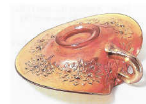
41. Orange Tree