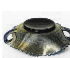
8. Butterfly, threaded