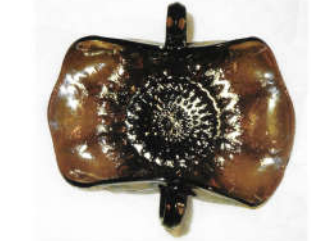
57. Stippled Diamonds