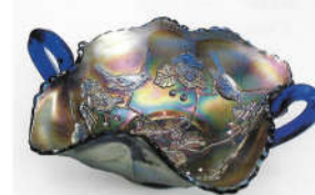
2. Birds and Cherries