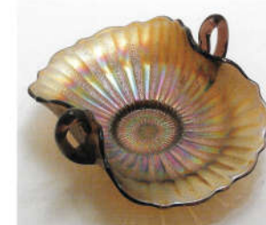
59. Stippled Rays