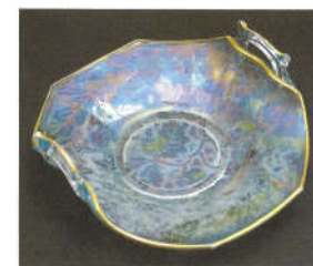
3. Brocaded Acorn