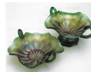
44. Peacock Tail