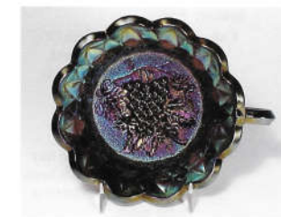
24. Heavy Grape